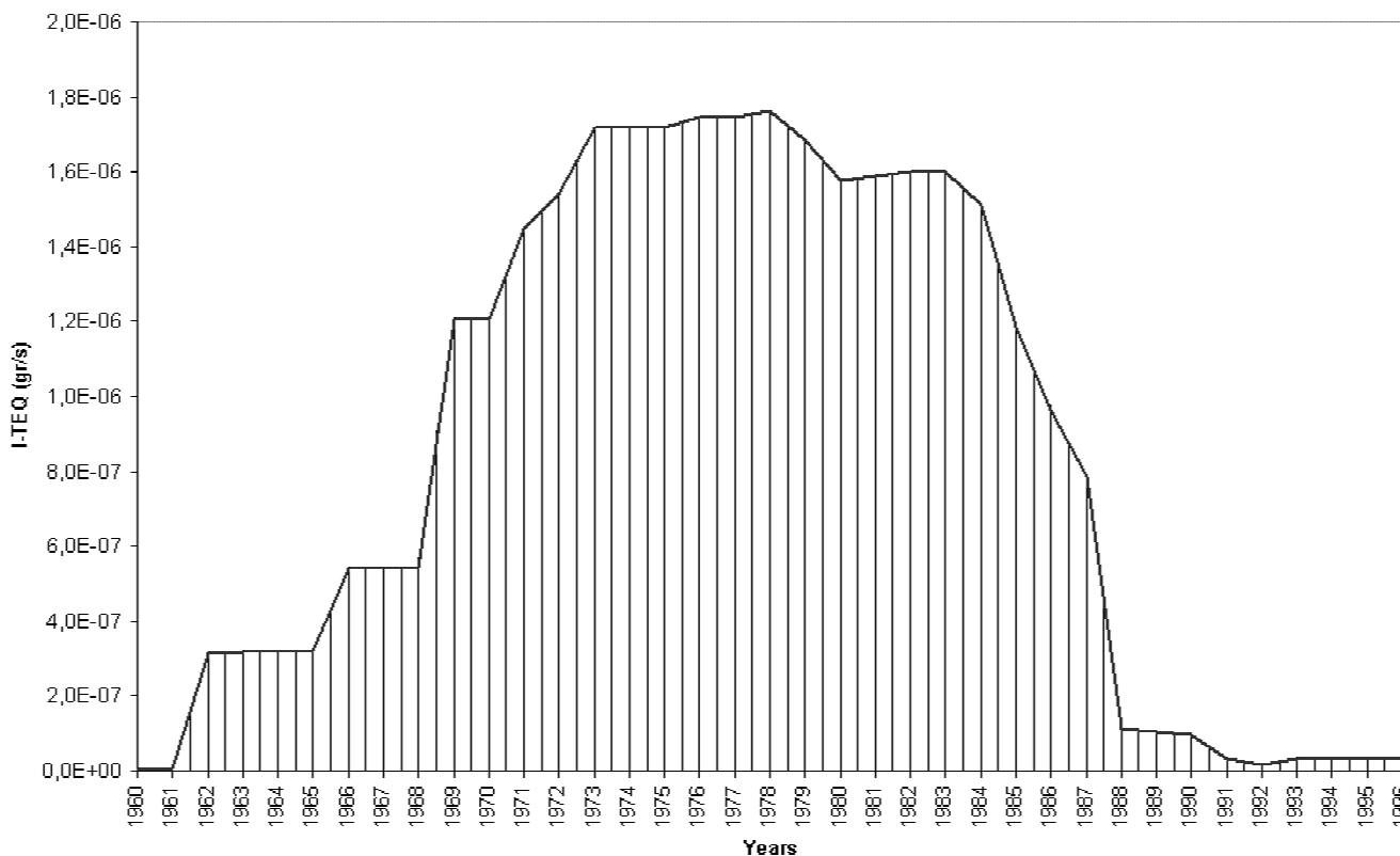
Figure 2 Trend by year of the emission levels of the incinerators and industrial plants (I-TEQ gr/s).

A specific value for exposure was calculated for each point (geo-referenced address); the value for each address in a given year is the sum of the values calculated for the plants that were active during that year and were located within a 50 kilometre radius. The exposure value for each subject is the average of the values of the single addresses,