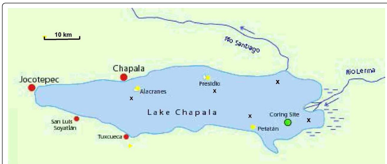
Figure 1 Map of Lake Chapala and Study Locations. Suspended particle sampling sites are shown as x's and named (Table 4) for nearby rivers (Lerma and Santiago) or islands.

Samples of fish from Lake Chapala, including commonly consumed carp, charales (whitefish), and tilapia were obtained by purchase from local fishermen who were observed catching the fish from the lake. The samples were originally stored at 0-4°C, but warmed to ambient temperature during the two-day transport to Rensselaer Polytechnic Institute (RPI). Subsequent testing (see Table S-2, Additional file 1) indicated that such handling does not significantly affect total mercury concentrations. Samples of skinless filet from tilapia and carp as well as headless, eviscerated charales, typical representations of "edible portions" of the respective species,