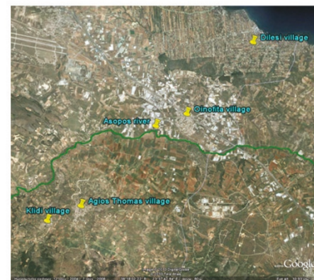
Figure 1 Map of the Oinofita municipality (study area) in Greece. Panel A: Oinofita municipality lies at the border of the Voiotia with the Attica prefecture. Panel B: Oinofita municipality is comprised of four villages: Klidi, Agios Thomas, Oinofita and Dilesi. The high industrial concentration near Asopos river can also be observed.

drinking water. Regular protests ensued from the 1990s onward. In 2007, the Ministry of Environment, Regional Planning and Public Works of Greece imposed fines on 20 industries for disposing industrial waste with high levels of hexavalent chromium into the Asopos river.