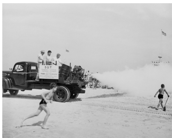
Figure 1 Fogger truck sprays Jones Beach in New York with DDT, 1945 (source: Corbis Images).

banned in 1972 (see timeline, Figure 2) [10]. p,p' -DDT exposure has been inconsistently linked to breast cancer despite having both estrogenic and carcinogenic properties [11,12]. Acute, high dose exposure to commercial DDT (which contains the more strongly estrogenic compounds o,p' -DDT and p,p' -DDT) has been shown to increase mammary cell proliferation in animal models [13,14] whereas chronic low-dose exposure through the diet is more predominately composed of the metabolite p,p' -DDE, which has little to no estrogenic effect [14]. DDT is still utilized to combat malaria, and more evidence regarding its role in possible health outcomes could either expand its use for vector control or encourage the use of other pesticides [15].