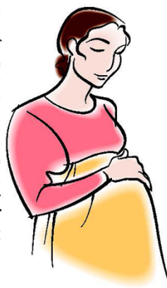
Fig. 3 ACAT BMPS recruitment flyer

Protecting Health, Assuring Justice www.akaction.org